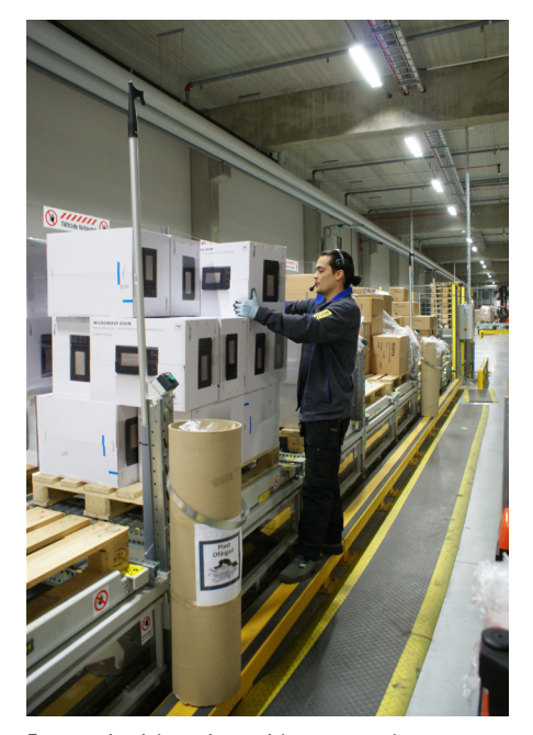
Ergonomic pick stations with automated empty-pallet handling