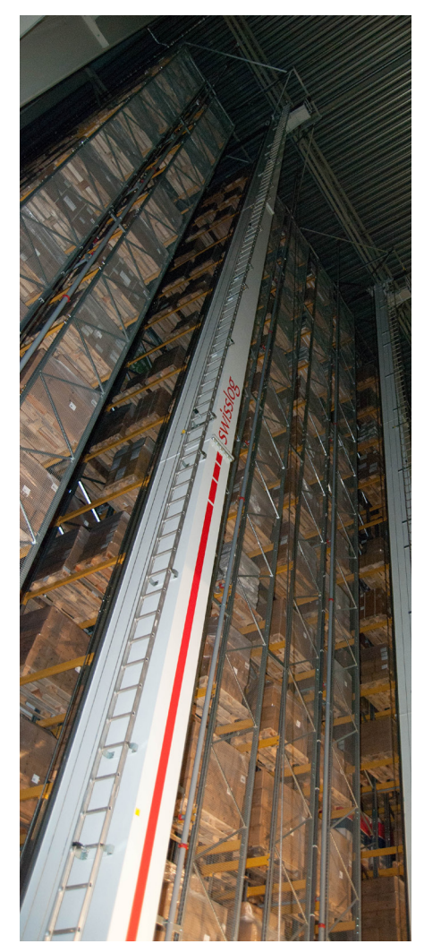
Swisslog Vectura Stacker Cranes

Swisslog's delivery to Rusta is a typical example of how an overall integrator takes full responsibility for the integration of the best hardware, software as well as service and support that ensures stable and continuous operation.