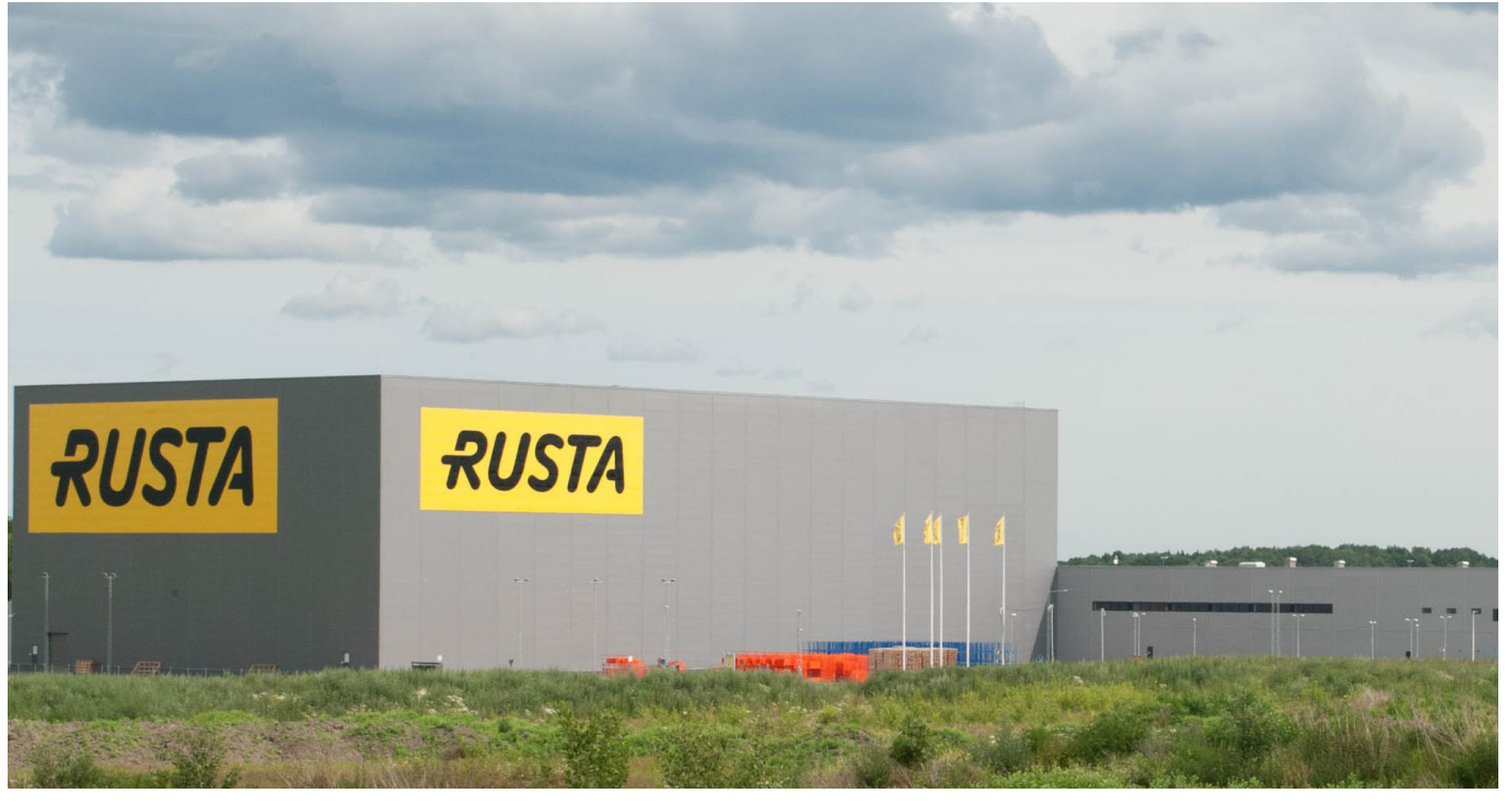
High-bay warehouse with 121,000 pallet locations